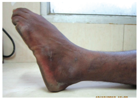
Figure:6 Post operative Plantar flexion