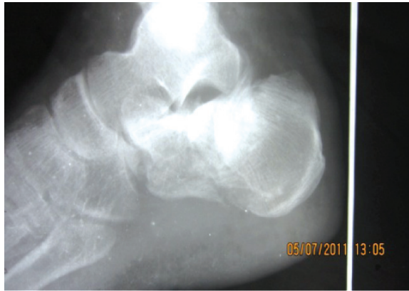
Figure: 3 Pre operative X-Ray