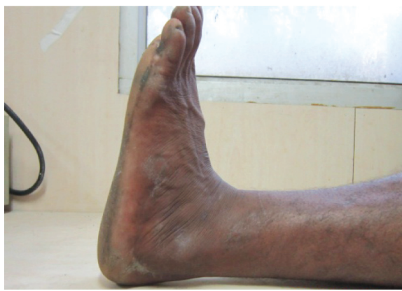
Figure:5 Post operative Dorsiflexion