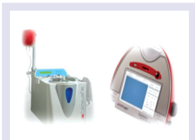
Figure 2: Equipment for testing Menstrual Blood

The process for collection of menstrual blood is simple. Like tampon, a silicon cup is inserted in the vagina on the day of heaviest flow. The cup needs to be placed inside the vagina for at least three hours so as to collect approximately 20 milliliters of blood. This is then poured in the collection kit and is sent back to the menstrual blood bank laboratory where it is processed, frozen and stored. The menstrual stem cells are stored in two cryo vials that are overwrapped to safeguard them during storage [2] .